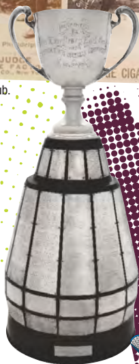
The Grey Cup, awarded every year to the best team in the Canadian Football League

It was Canadians who introduced Americans to this sport when players from Montreal's McGill University played a variation of rugby against Harvard University in 1874. The games developed a bit differently, with Canadians still playing on a bigger field under our own rules. The biggest prize in Canadian football, the Grey Cup, was donated by Earl Grey, the Governor General, in 1909.