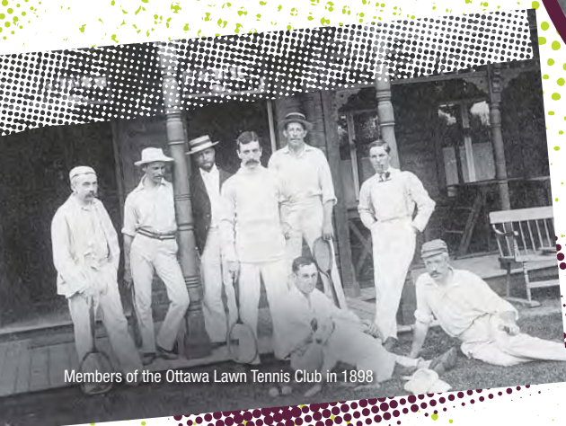
Members of the Ottawa Lawn Tennis Club in 1898

Scottish immigrants brought golf with them to Canada in the 1800s. Although the first golf clubs sprang up in Quebec and Ontario, the first 18-hole course didn't arrive until 1893 in Victoria, B.C.