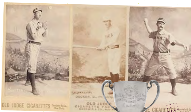
Players from the 1887 Toronto Baseball Club.

Many people — well, many Canadians — insist that the first ever game of baseball was played in Beachville, Ont., in 1838, seven years before the first recorded game in the U.S. The sport grew out of the English game of rounders, which has posts instead of bases, and whose players use their bare hands.