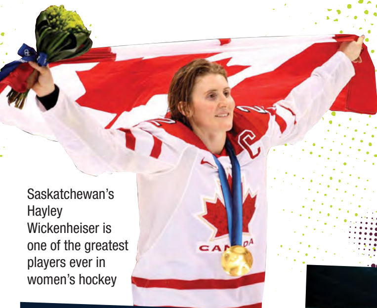
Saskatchewan's Hayley Wickenheiser is one of the greatest players ever in women's hockey

Goalie Patrick Roy hoists the Stanley Cup after the Montreal Canadiens' victory in 1986. The Canadiens have won the cup 24 times, more than any other team.