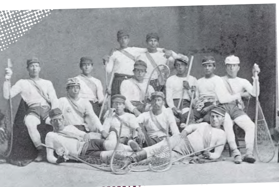
1869 Canadian lacrosse champions from the Mohawk community of Kahnawake, Que.