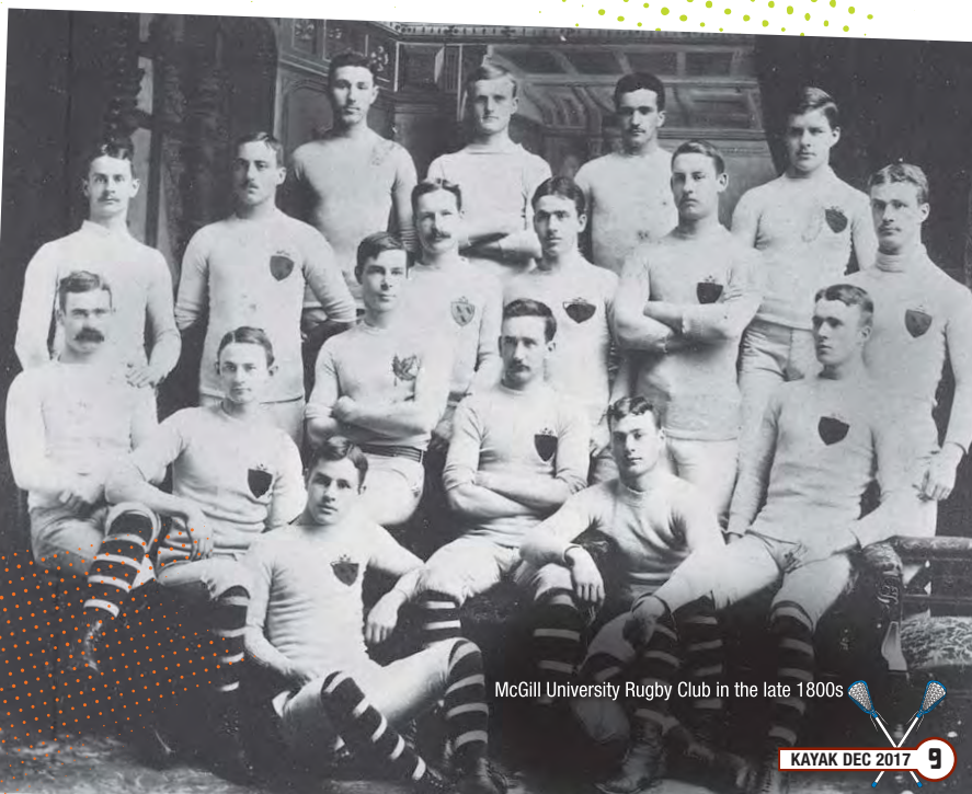
McGill University Rugby Club in the late 1800s

Although it was introduced in eastern Canada first, rugby really took off in Vancouver, partly due to the milder weather. The first organized game happened in Montreal in 1865 between British military men and students from McGill University.