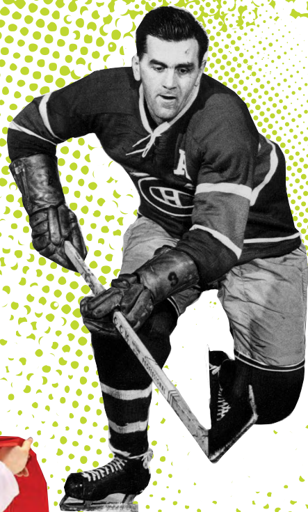
The amazing Maurice "The Rocket" Richard played for the Montreal Canadiens in the 1940s and 1950s.

Lots of places in Canada claim to be the birthplace of hockey, but we don't know for sure where or how it started. The first organized game took place in Montreal in 1875. The name for the sport probably came from hoquet , the French word for a shepherd's tall, hooked stick. Hockey is Canada's official winter sport. The National Hockey League celebrates its 100th anniversary in 2017. The NHL was founded on Nov. 26, 1917, and the first official games were played on Dec. 19.