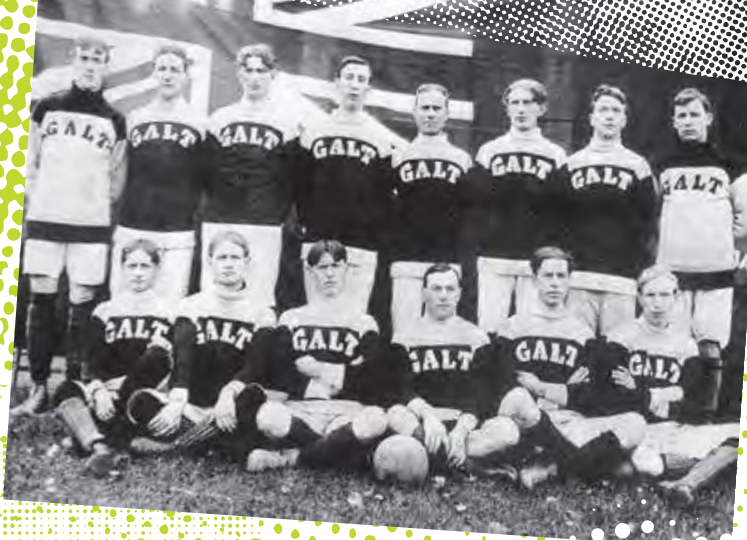
Ontario's Galt Football Club, formed around 1881, won the 1904 Olympic tournament

More commonly called football in its early life, soccer was considered unladylike from the first days of organized play in the 1870s until well into the 1950s. In 1904, the Canadian men's team won gold in its first-ever Olympics.