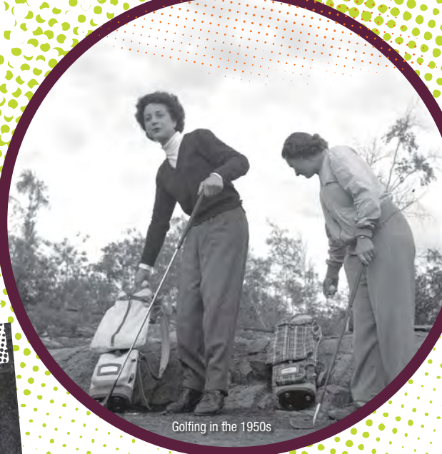
Golfing in the 1950s