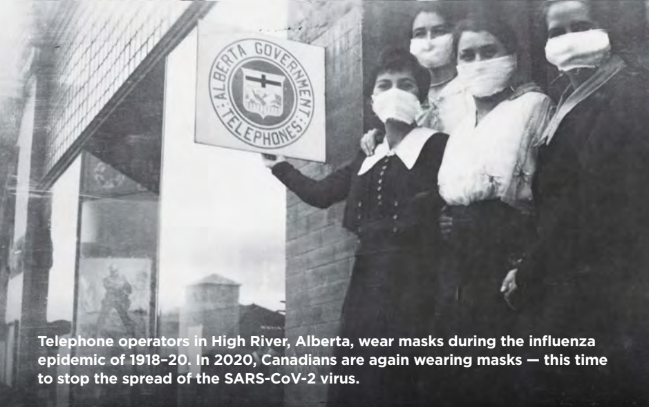
Telephone operators in High River, Alberta, wear masks during the influenza epidemic of 1918-20. In 2020, Canadians are again wearing masks — this time to stop the spread of the SARS-CoV-2 virus.