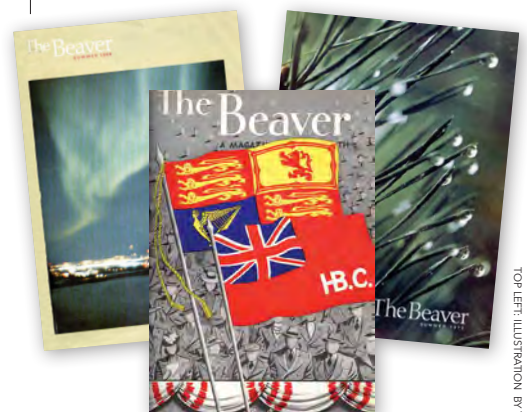
The Beaver magazine will turn one hundred in October 2020.

The editorial team continues to work on the special collector's issue, which will be published in October 2020.