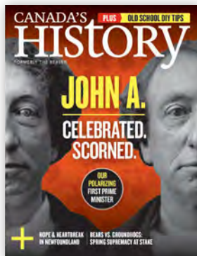
The February-March 2019 issue of Canada's History .

Canada's History also continues to expand its reach online. For instance, the number of followers for our social media channels rose by 28.8 per cent (compared to the year previous) to 106,178 followers. Work has begun on two special video projects that will share compelling digital history content with both students and adult Canadians across the country. And our digital content is shared widely, with more users engaging deeply with stories and videos.