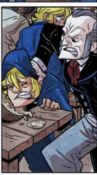
*A PLACE WHERE POOR CHILDREN WITH NO FAMILY WERE SENT TO LIVE